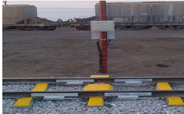
Software and Data Interfacing

• Operate on a fully automated and fully unmanned basis. • Generate specific automated reports. • Trigger alarms if pre-selected field values are exceeded. • Store data when off line and then to transmit this data once connectivity has been re-established. • Interface with a range of ERP systems.