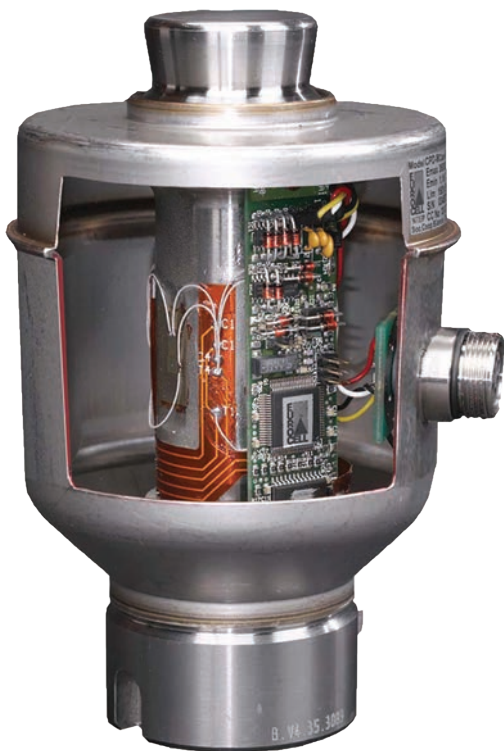
CPD LOAD CELL