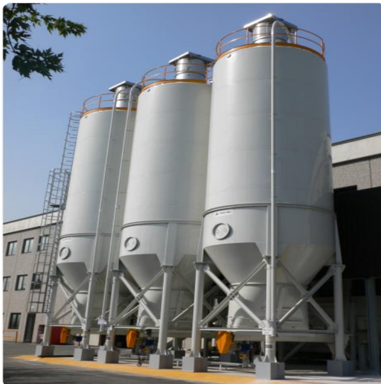
Typical Silo Weighing System

Sasco Silo Weighing Systems provide solutions for nearly every bulk silo application from fluids through to animal feeds and grain industries, amongst others. stainless-steel housing.