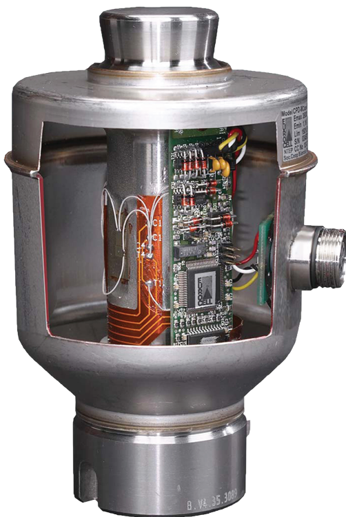
CPD LOAD CELL