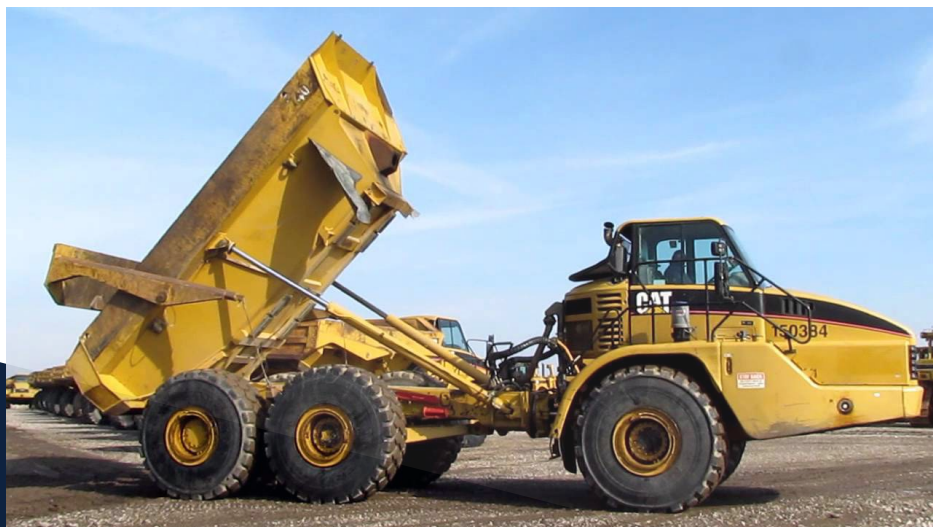
ARTICULATED DUMP TRUCK