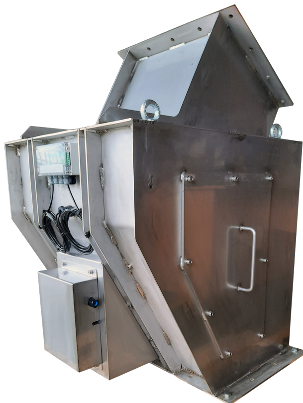
Sasco IW Series Impact Weigher