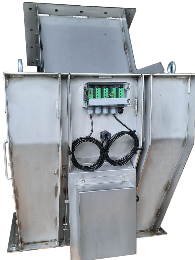
Sasco IW Series Impact Weigher ready for installation at a sugar mill

Sasco's IW Series of Impact Weighers are all highly robust and are of all steel housing construction with a stainless-steel impact plate and mounting, with the option of a full stainless-steel housing.